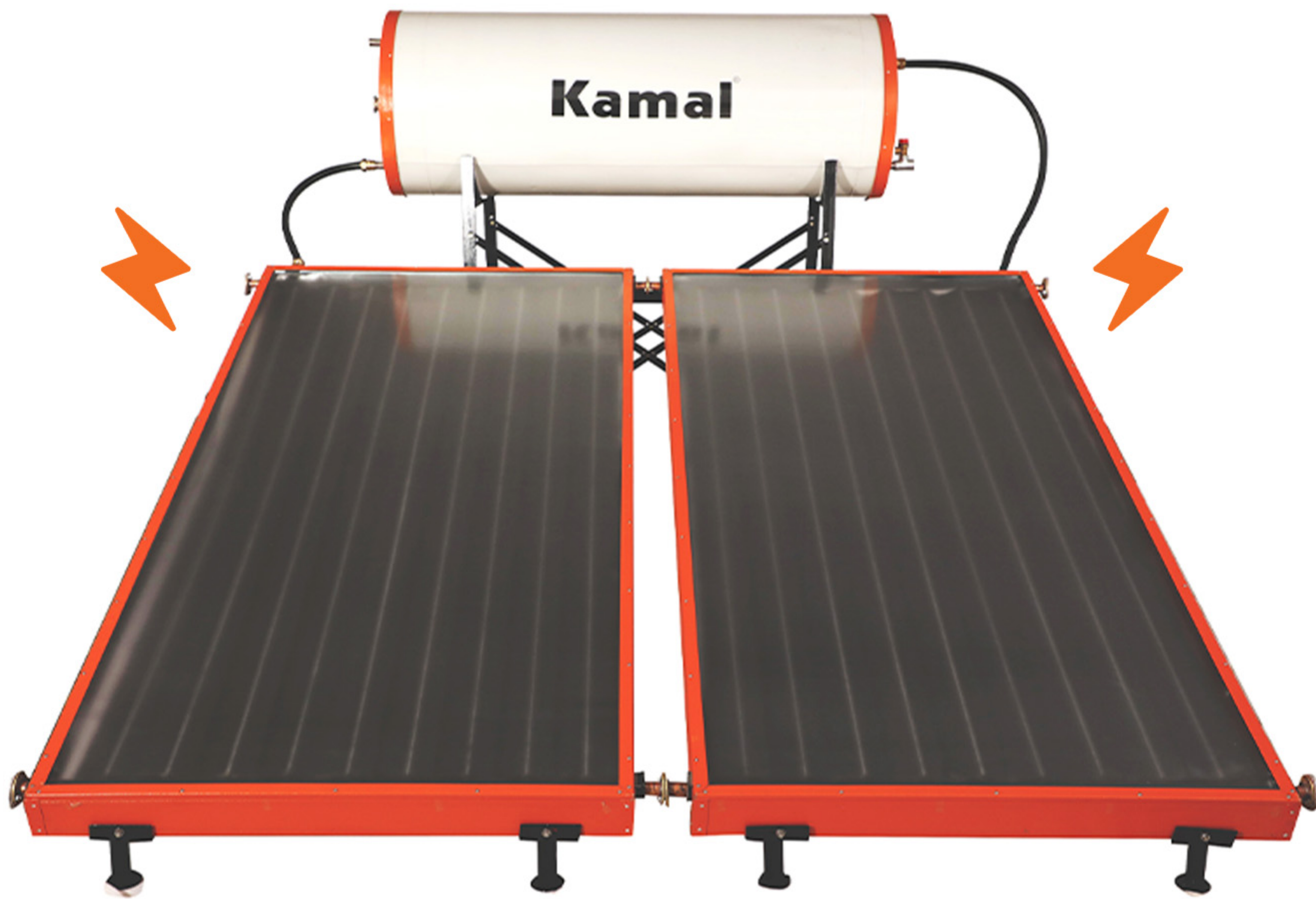
FLAT PLATE COLLECTORS (FPC)