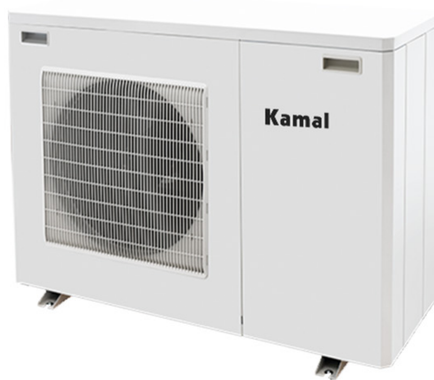
Air Source Heat Pump (ASHP)