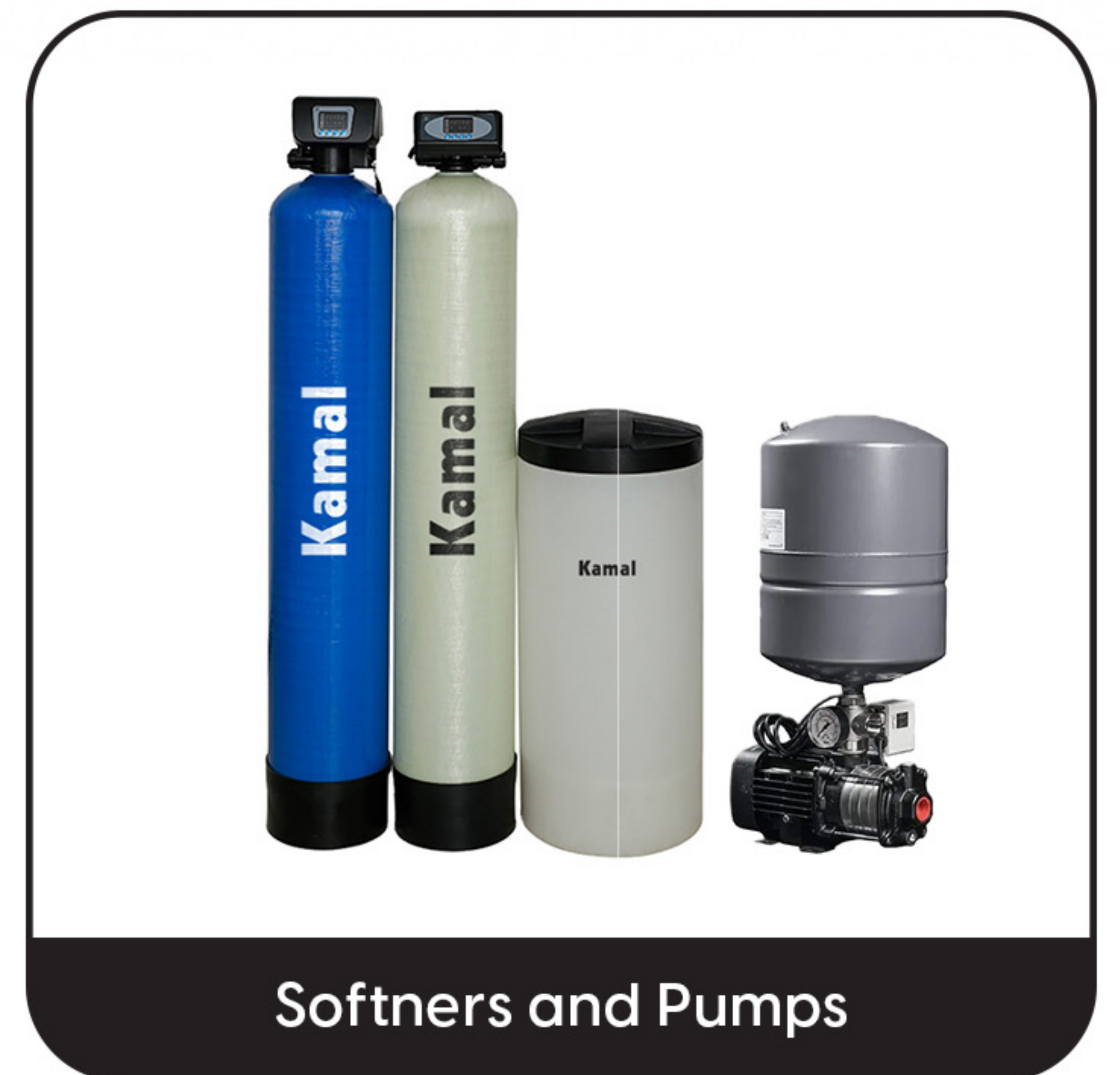
Softners and Pumps