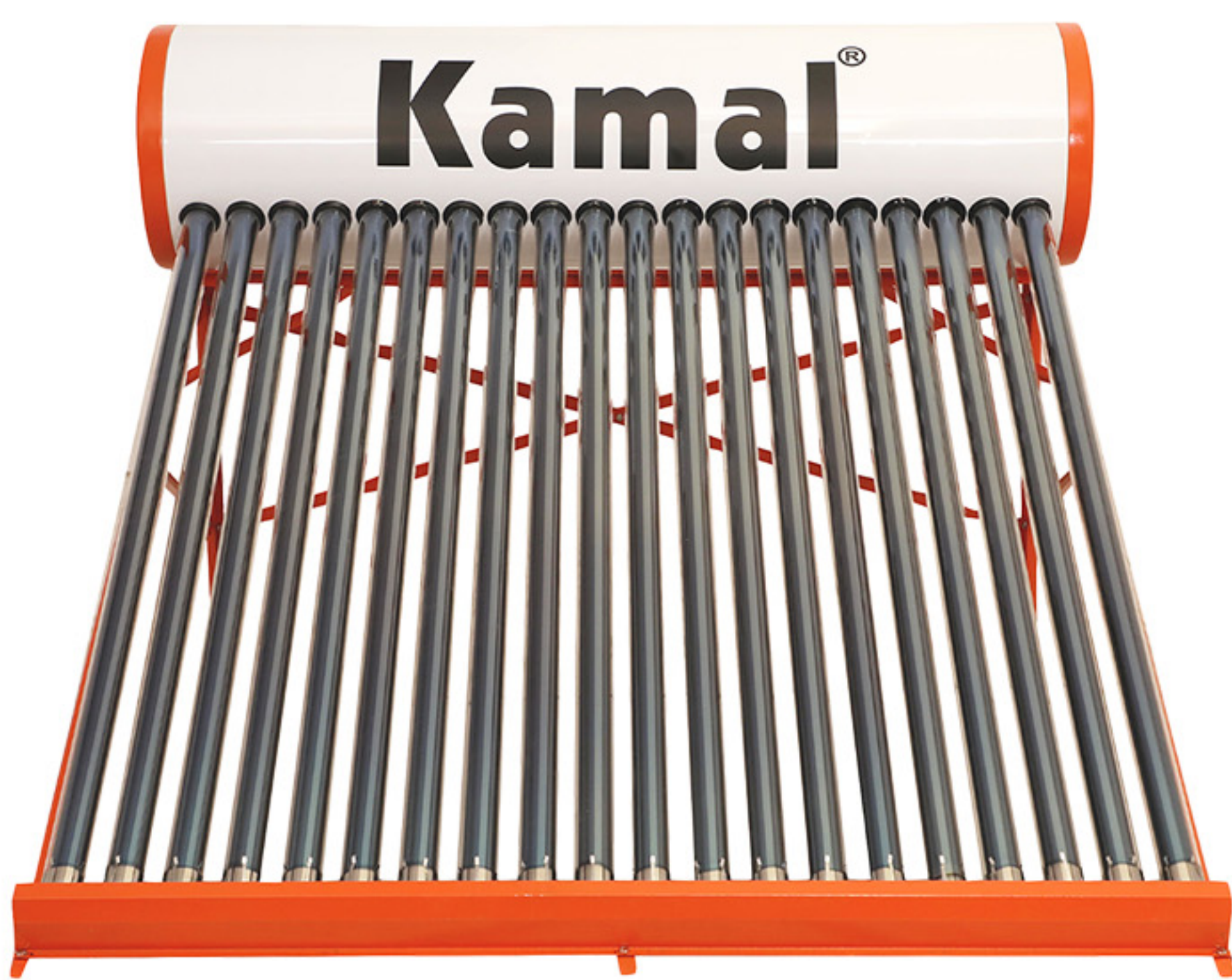
Evacuated Tube Collectors (ETC)

Available from 100 ltrs to any capacity. COPPER INNER TANKS Available (optional)