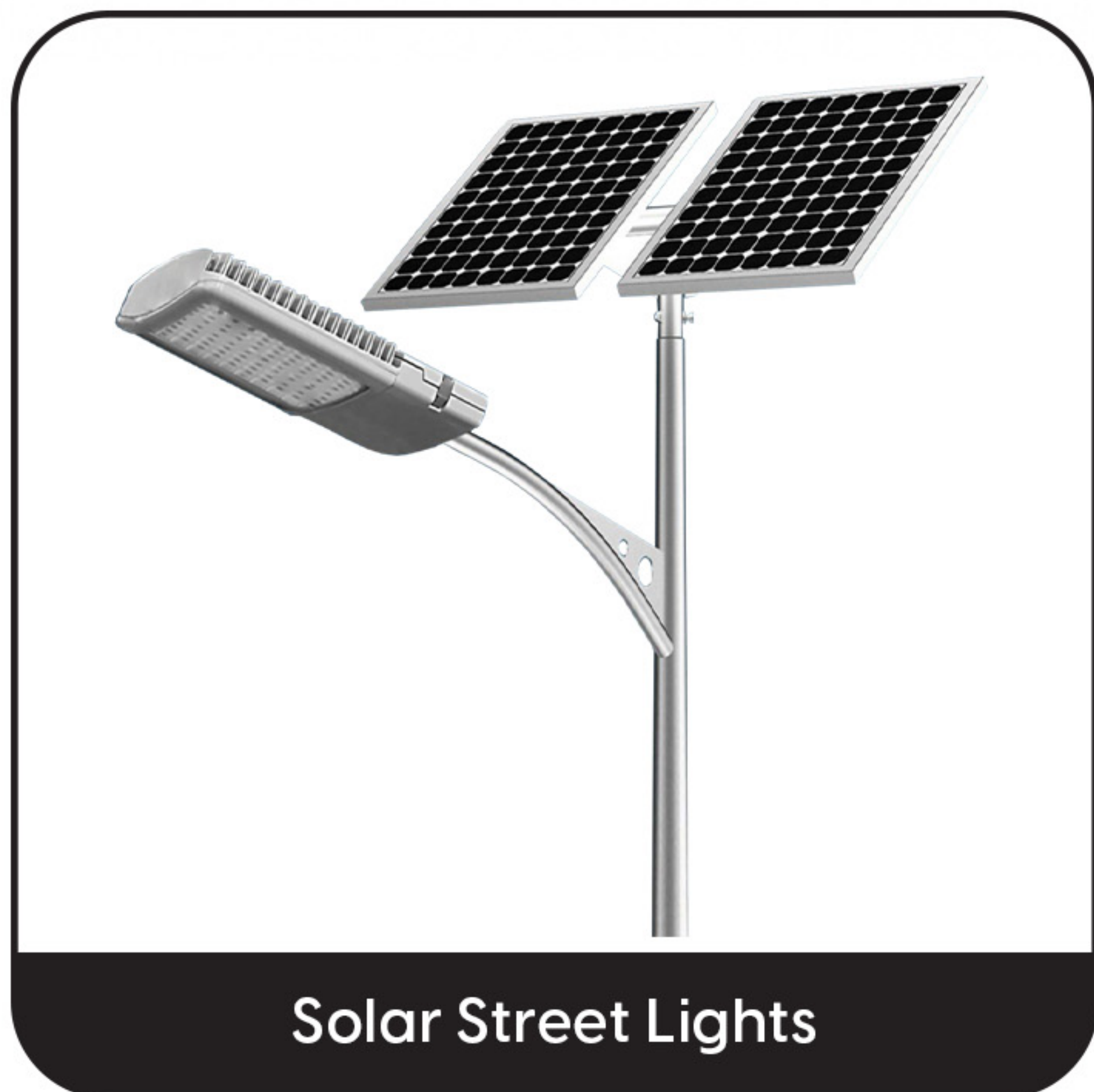
Solar Street Lights